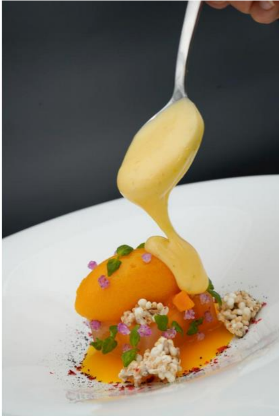
S.Pellegrino Sapori Ticino.