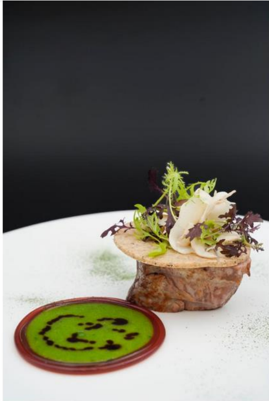
S.Pellegrino Sapori Ticino.